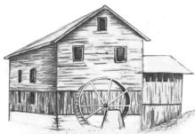
Cider Mill Properties